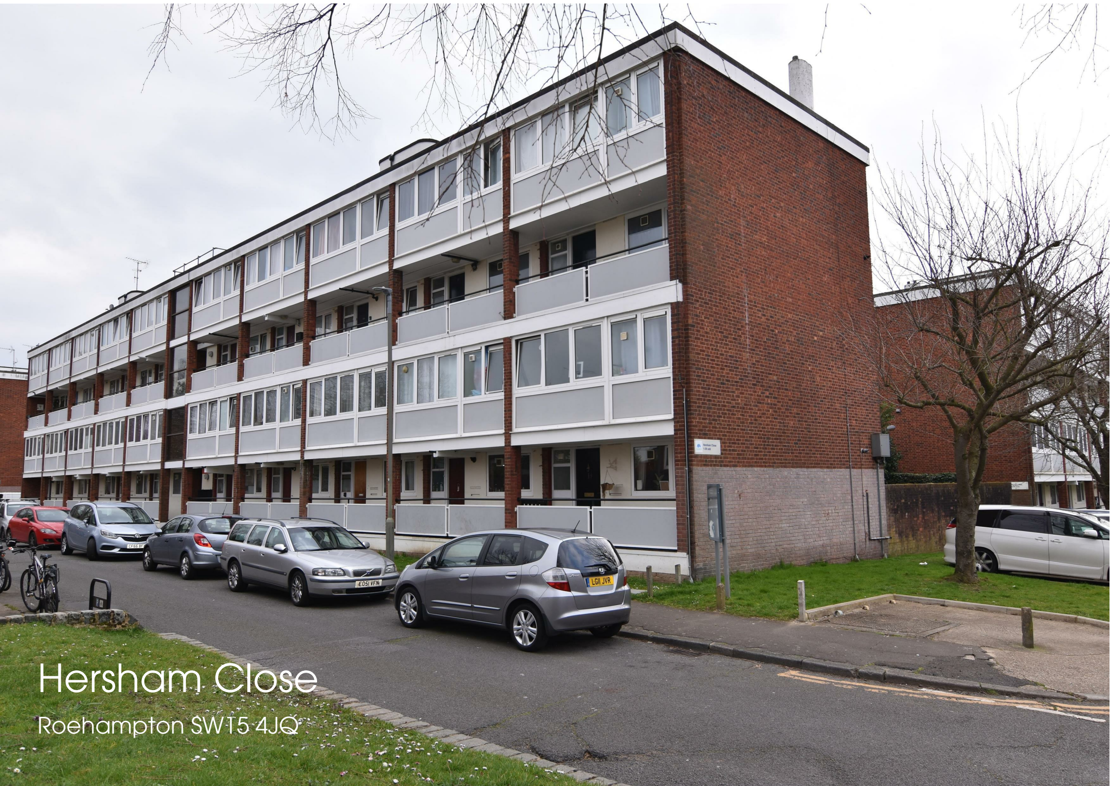
Hersham Close Roehampton SW15 4JQ